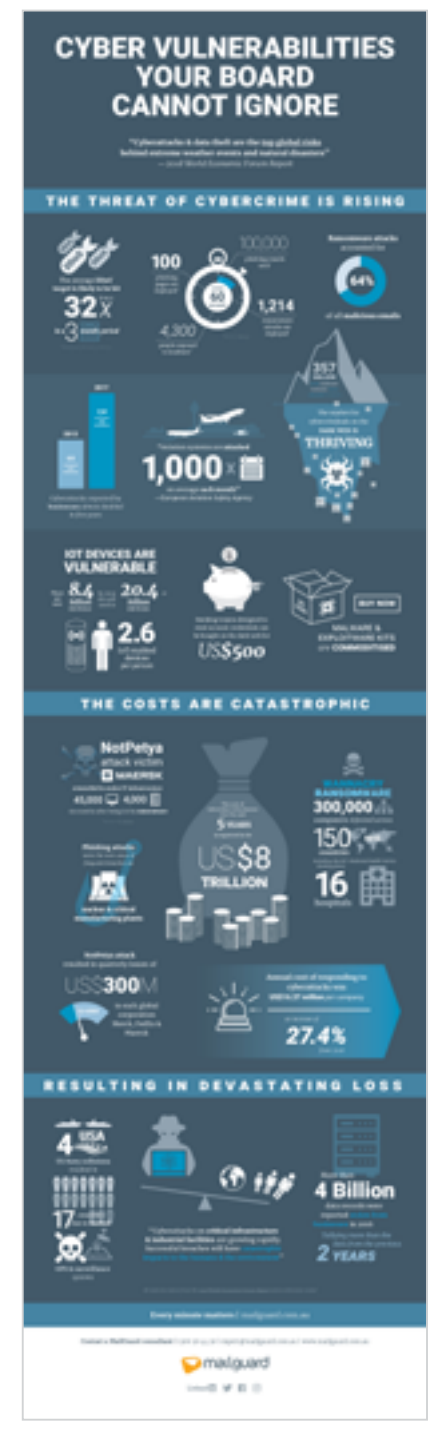
CYBER VULNERABILITIES INFOGRAPHIC