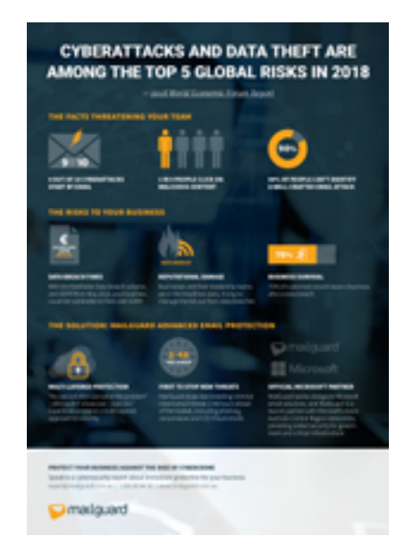
CYBERATTACKS & DATA THEFT BROCHURE

Please speak to your MailGuard Account Manager for co-branding requests or ideas for new marketing content to help support you.