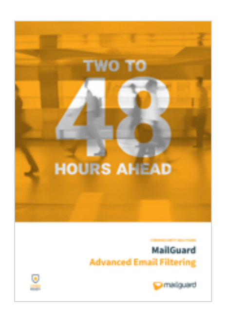
MAILGUARD PRODUCT BROCHURE