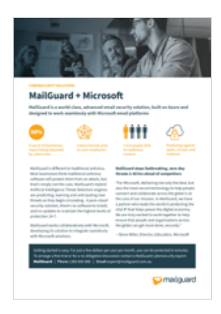
PARTNERING WITH MICROSOFT FLYER